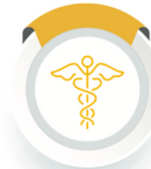
Healthcare Industrial UV