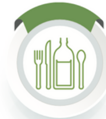
Food & Beverage Industrial UV