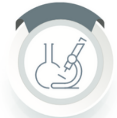
Pharmaceuticals Industrial UV